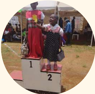
PP2T Girls in Mum's Dress