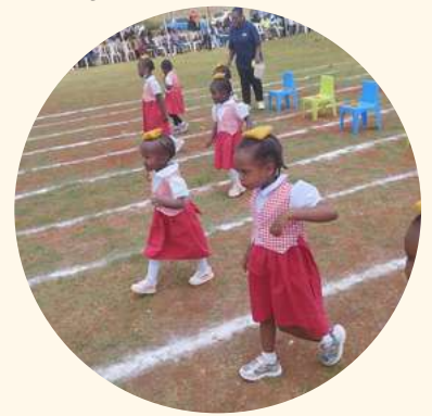
PP1S Girls Balancing Bean Bag