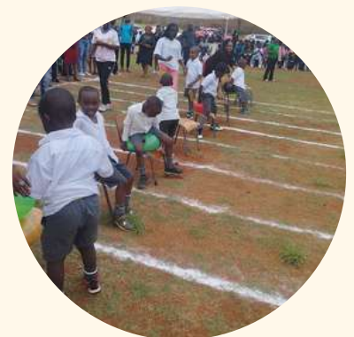
PP2R Boys Bursting Balloons