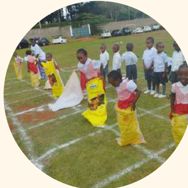
PP2R Girls Sack Race