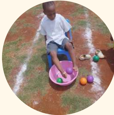
PP1C Boys Picking Balls