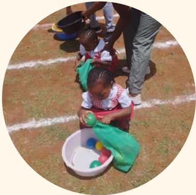
HST Girls Collecting Balls

Scenes from Pre-Primary Sports Day, 31st March 2023